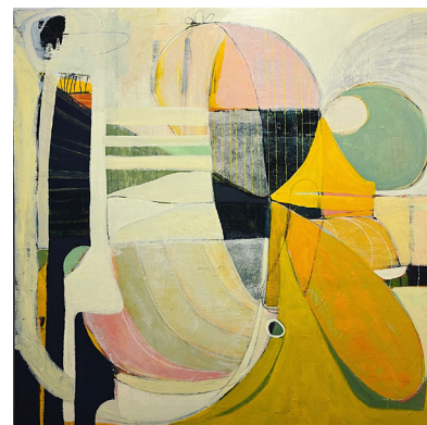
L - R: Elaine Weiner-Reed, Renaissance Meets Revolution , acrylic, latex, and paper mache on stretched canvas, 20" w x 20" h; Leslie Nolan, Daniel , acrylic on stretched canvas, 18" w x 14" h; Nancy Cloonan, Outside No. 4 , acrylic, graphite, crayon, grease pencil, 30" w x 30" h