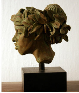
(clockwise from top) Gil Ugiansky, 17x17x12 Lesa Cook, 6x12x8 Lars Westby, 10x11x28