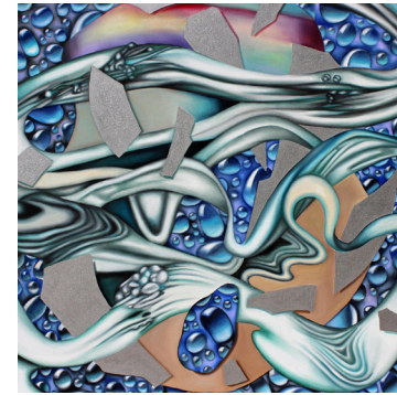
Cindy Mehr, Sparkling Water, 36x36